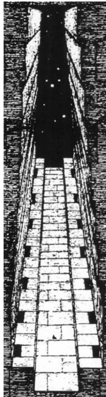
Interior of the Grand Gallery (about one quarter of its length), showing how it could have been used to observe the stars circling in the souther sky. The illustration shows the southern section of the meridian.

However, Romer might have a better chance to reach out to the true idea of a universal physical principle hidden in the discovery of that design, if he inquired about the shadow reckoning